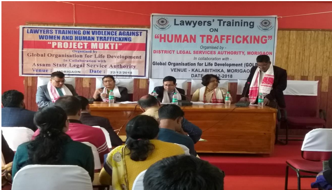
Lawyer's Training Programme organized by GOLD