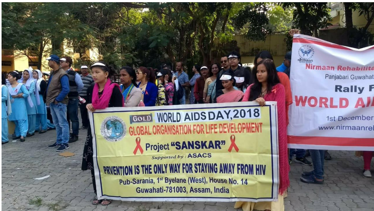
WORLD AIDS DAY observed by GOLD