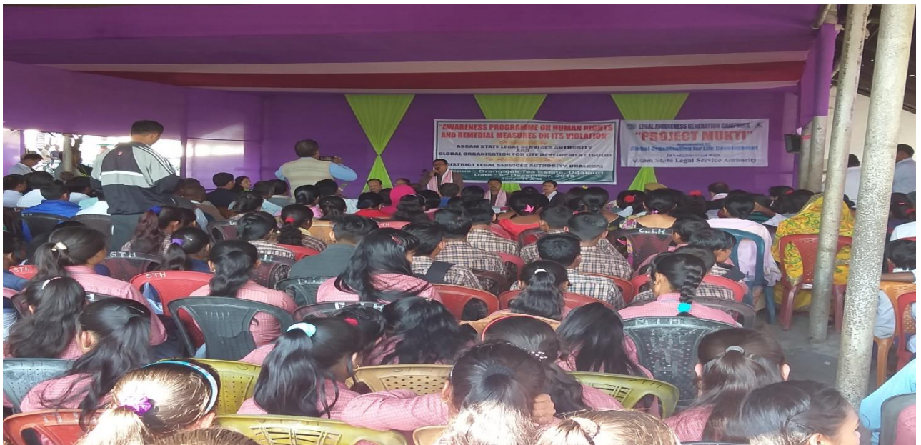
Legal awareness camp organized by GOLD at Udalguri