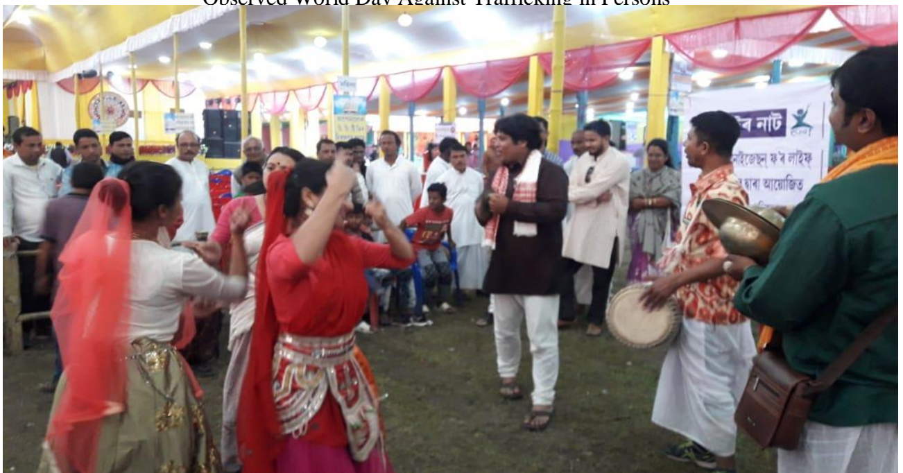
Mass Awareness through Street Play during “Raas Mohotsav”