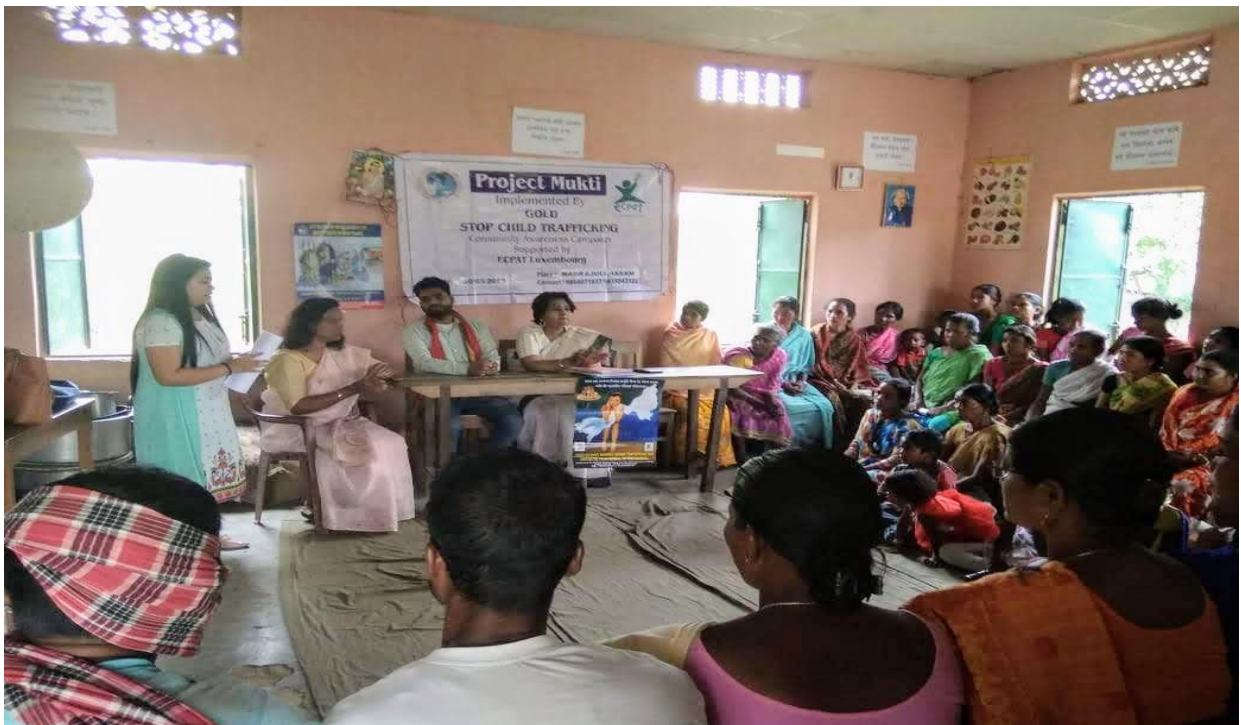
Community Awareness Campaign on Child Trafficking

Protest rally by the survivors of Trafficking