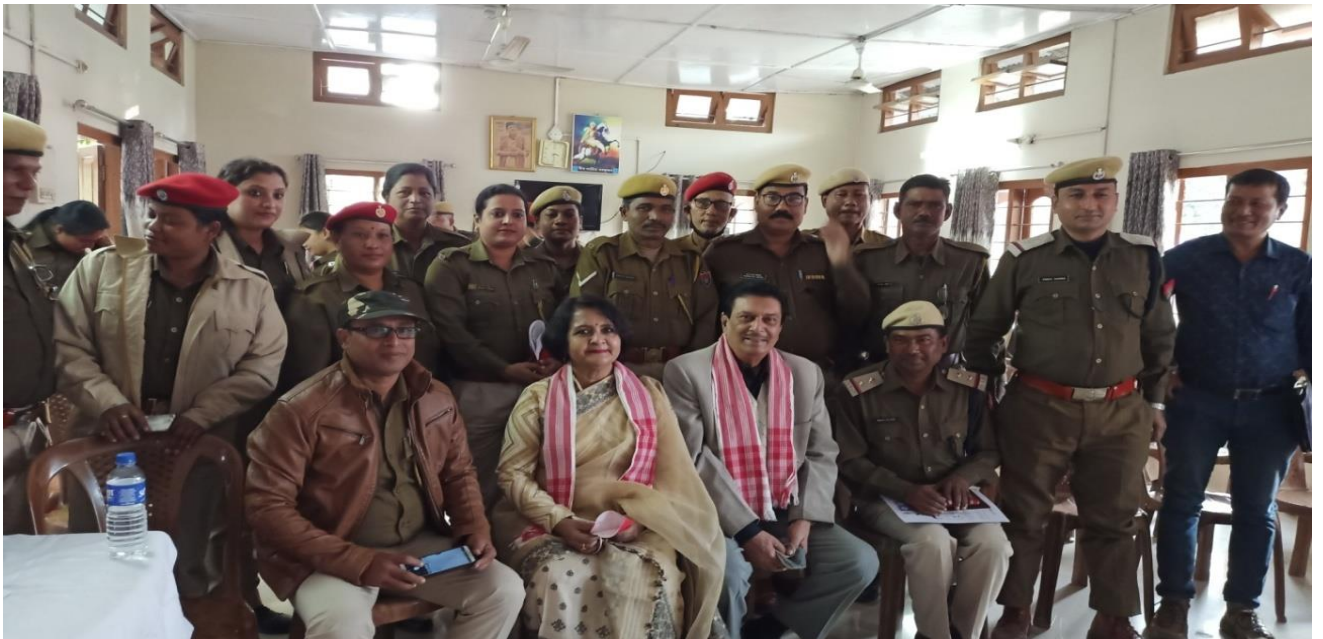
Sensitization programme of Law enforcement officials organized by GOLD