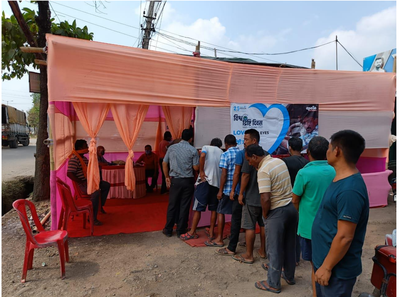
Free Vision Camp by ATHCC,GOLD