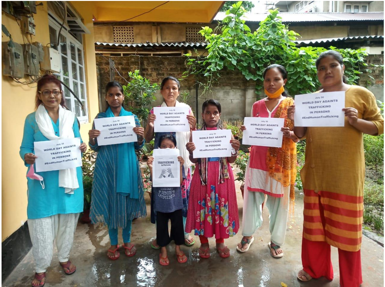
World's Day against Trafficking in Persons by Ujjawala Shelter Home, GOLD