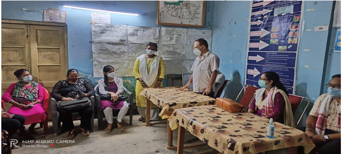
Distribution of seed money to the trafficked victim