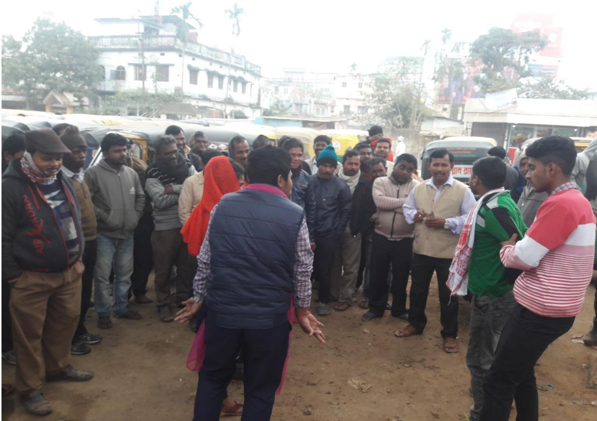
Awareness on HIV among the truckers at Agartala by GOLD