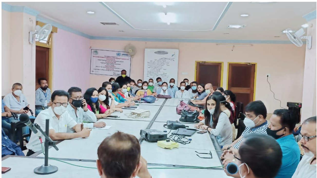
Capacity Enhancement training programme for health workers organized by GOLD,UNODC