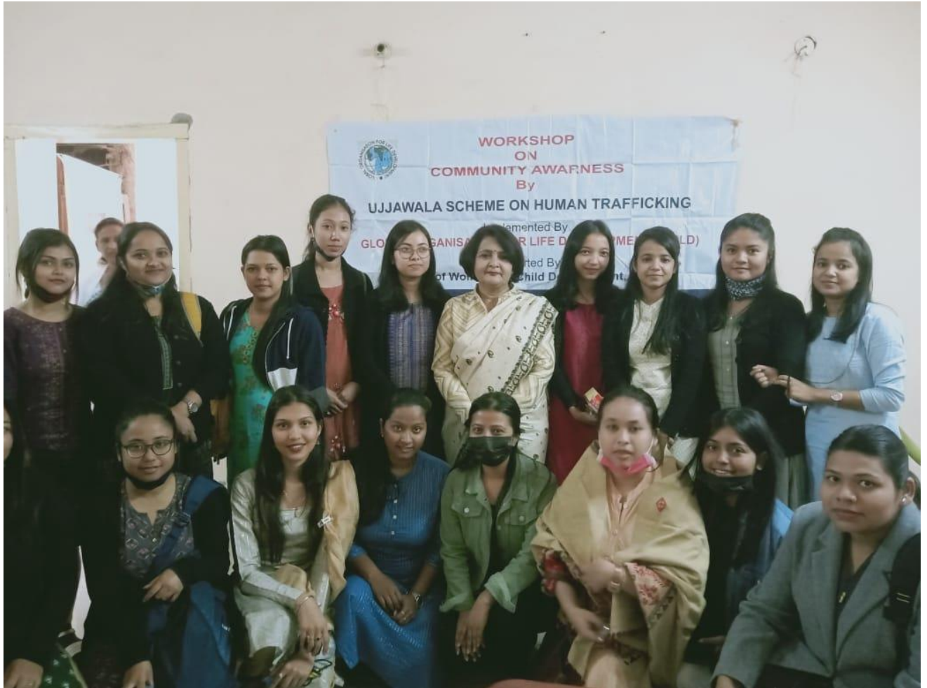
Workshop on Community Awareness by GOLD