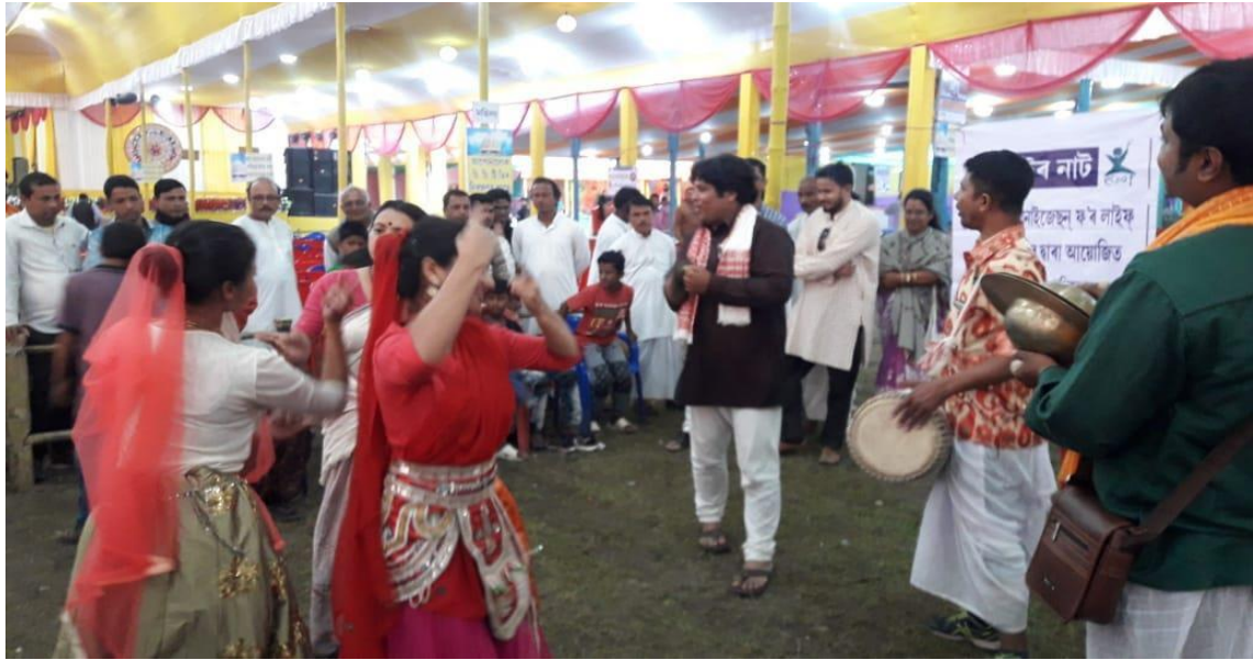
Mass Awareness through Street Play during “Raas Mohotsav”