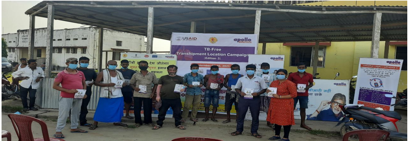
Tuberculosis free campaign conducted by GOLD