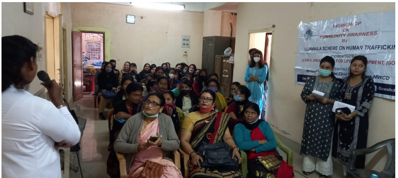
Workshop on Community Awareness on Human Trafficking organized by GOLD