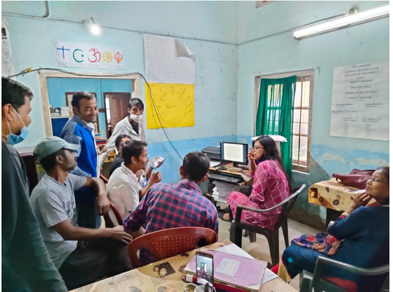
In house Training of Peer Educators by GOLD for "Project Sanskar"