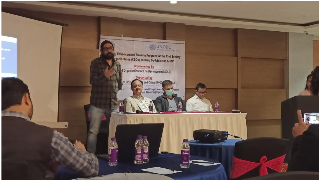
Capacity Enhancement Training Programme for CSOs