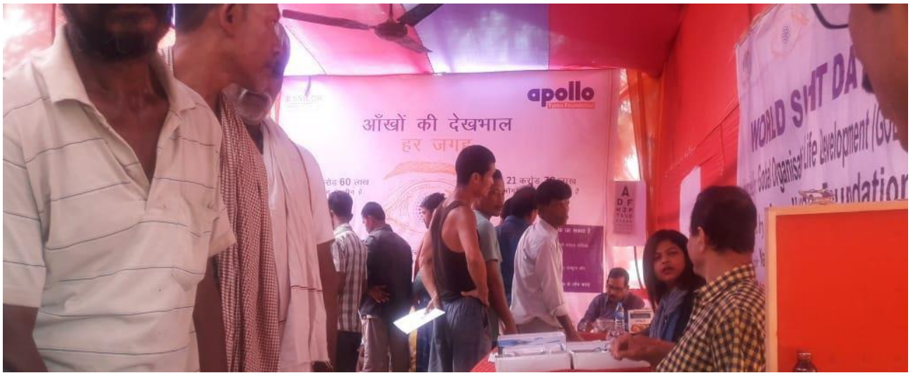
Organized Vision Camp on World Sight Day for the Truck drivers by Apollo Tyres Foundation