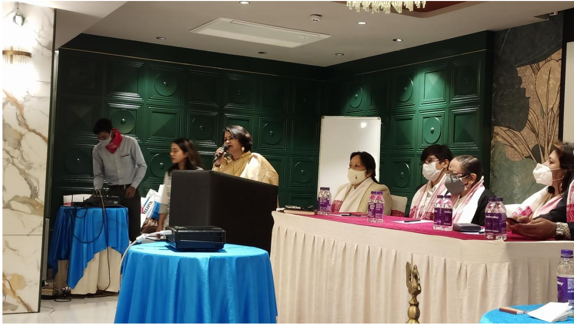
Workshop on removing stigma and discrimination against PLHIV