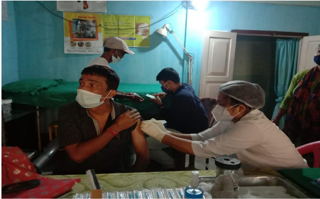
Covid Vaccination camp for PLHIV.