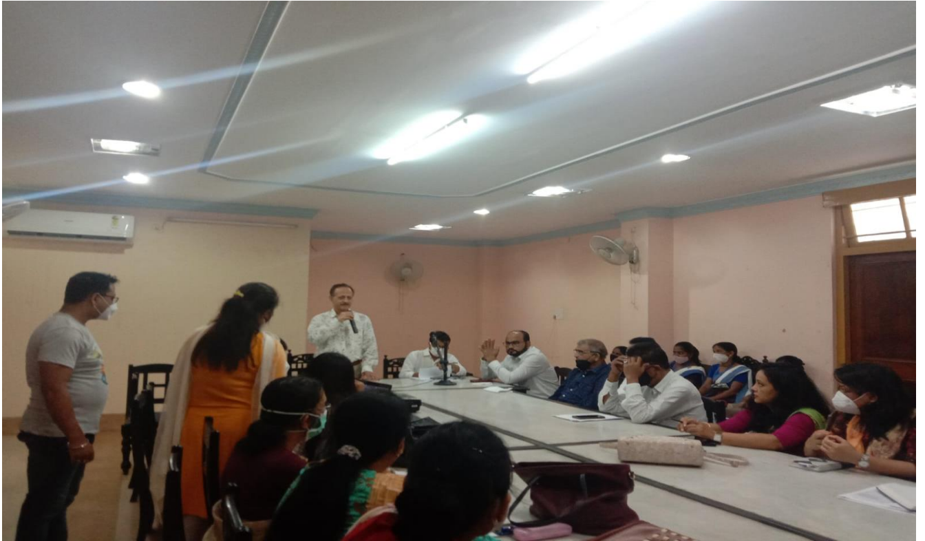
Health Sensitization Programme organized by GOLD at Nagaon