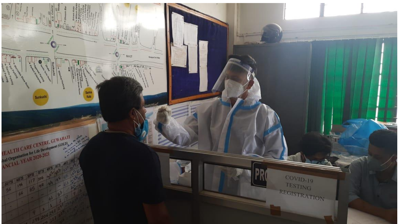
COVID Screening and Vaccination at ATHCC,GOLD