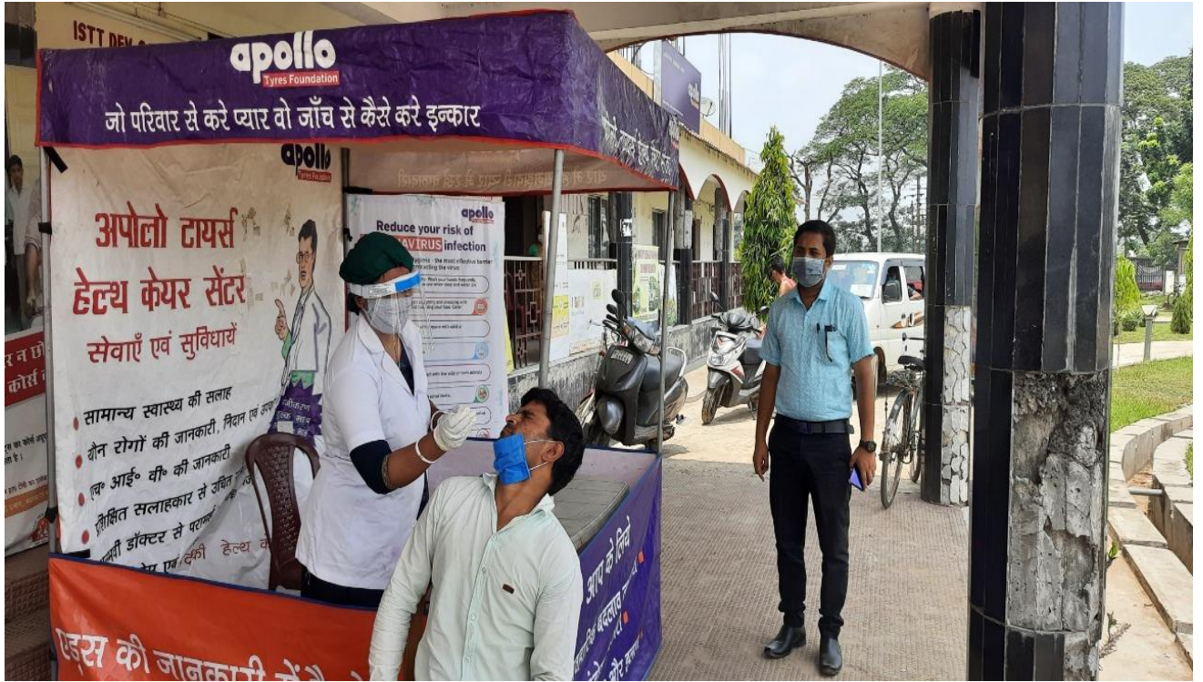
Covid screening test by GOLD at Agartala